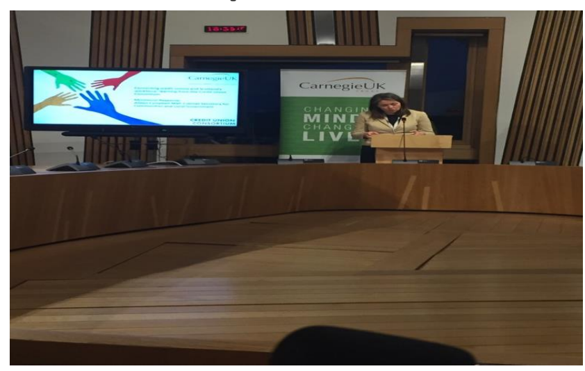
Aileen Campbell MSP, Cabinet Secretary for Communities and Local Government

Following on from the support given by the Welsh Government using its Financial Transactions Capital Fund the Scottish Government has pledged to make a £10 million loan fund available to Scottish credit unions from April 2020.